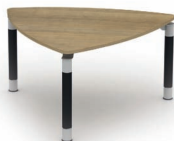
Triangular Meeting Table