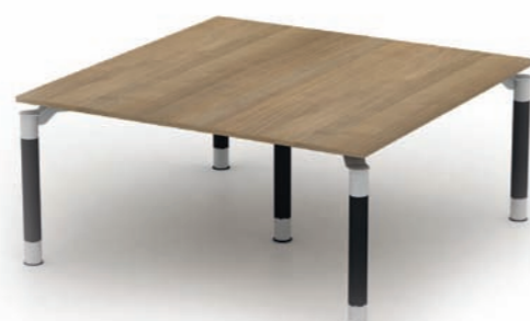
Square Meeting Table