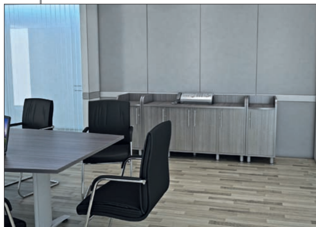
Table Shape - Boat Shaped Leg Option - Effex R8 (Option A) Board Finish - Anthracite Option Extras - Glass Storage - 4 Door Credenza Unit & Single Door Credenza Units

Reunion boardroom tables are available with four different leg designs. The main image is illustrated with an Effex R8 leg and a boat shaped top.