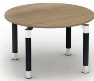
Circular Meeting Table