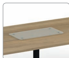
Glass on steel studs