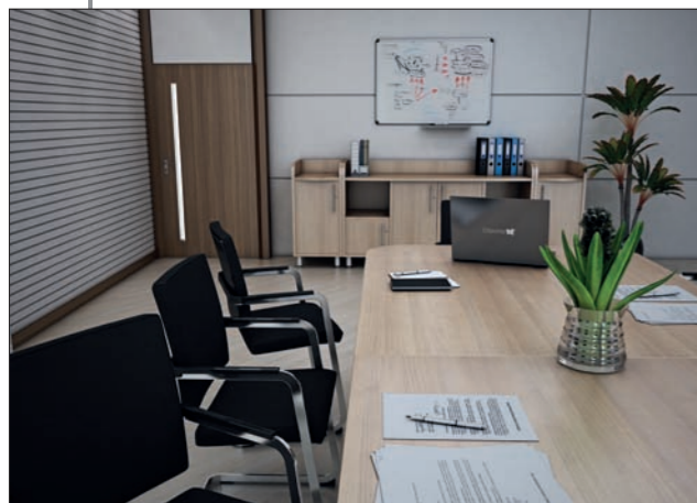
Table Shape - 2 Piece Shaped Rectangular Leg Option - Tulip Base Board Finish - Santiago Cherry Storage - 2 Door Credenza Unit & Single Door Credenza Units

Chrome Tulip Bases create a modern aesthetic appeal and offer leg sharing functionality. Reunion credenzas provide storage and enhance the boardroom environment.