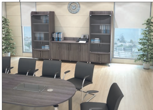
Table Shape - 2 Piece D-End Leg Option - Classic Solo (Option B) Board Finish - Anthracite Option Extras - Glass & Cable Ports Storage - 4 Door Credenza Unit & Glass Door Tall Units

D-Ended boardroom tables prove to be the most popular of styles, being further enhanced by the new chrome classic solo leg. Cable Ports are available as an optional extra.