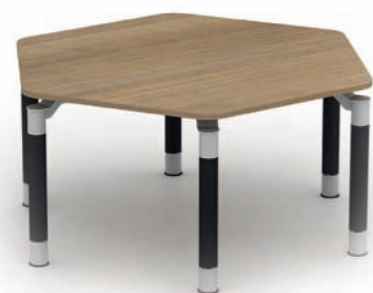
Hexagonal Meeting Table