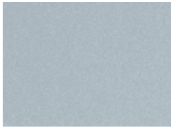
Elite Silver RAL 9006