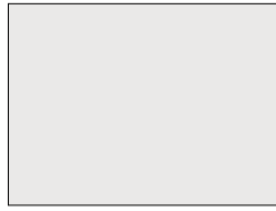
White RAL 9003