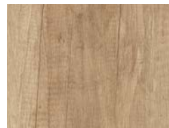
Natural Nebraska Oak