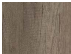
Grey Nebraska Oak