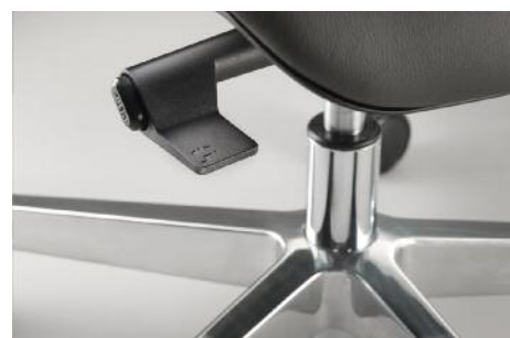
Body Weight Responsive Mechanism