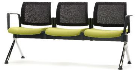
18-19 Beam SYSTEM