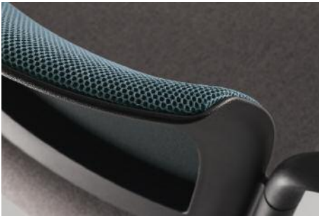
Dual Layer Mesh