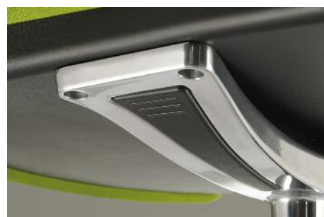
Seat Height Adjustment