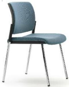
14-15 Meeting FOUR_LEG