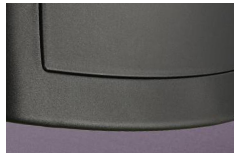
Standard Plastic Back