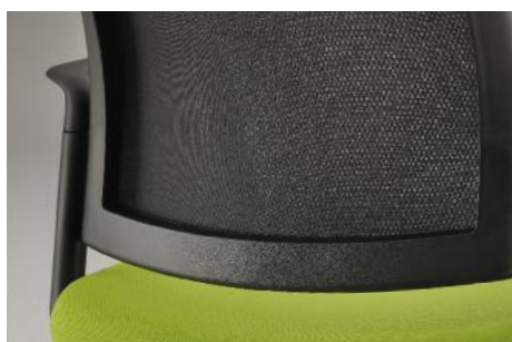
Various Back Options