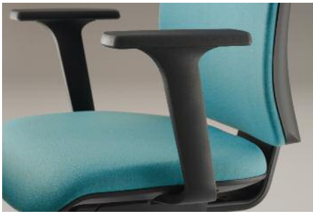
Fixed Arm Option