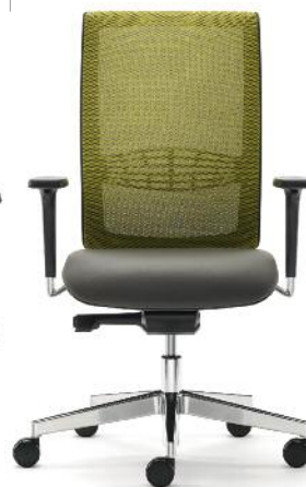
04-05 Task MESH_BACK