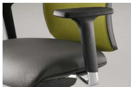
Chrome Arm Option