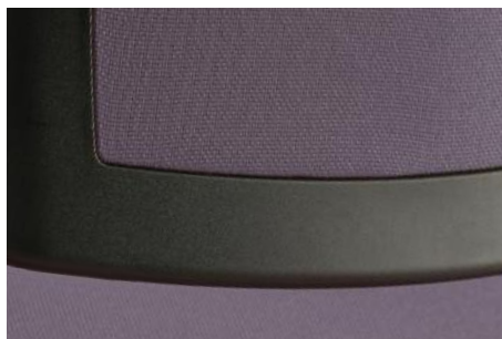
Upholstered Back Panel