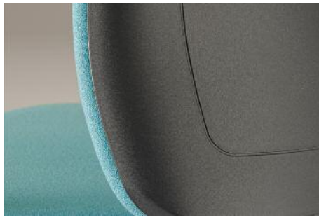
Plastic Outer Back