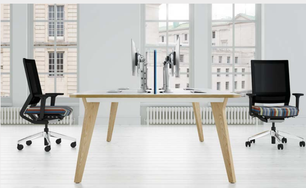
Dynamic angled leg posts provide a sleek attentive look.