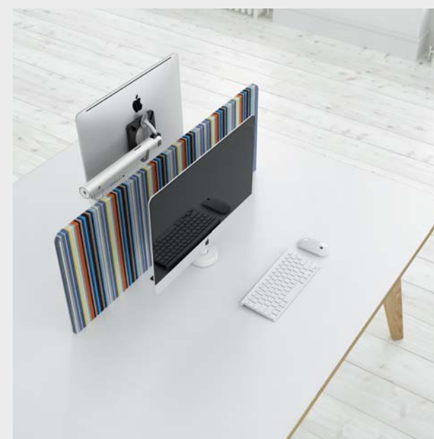
Acoustic dividing screens provides a noise reducing environment.