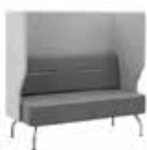
BRX 22 TT