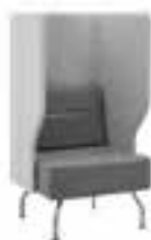
BRX 21 TT