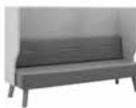
BRX 23 TT WL