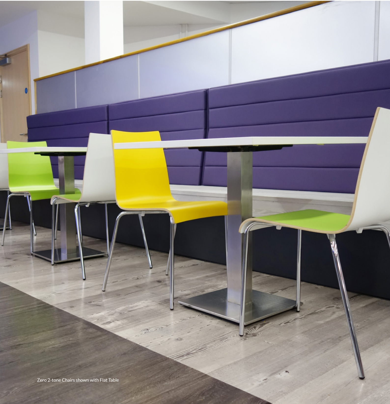
Zero 2-tone Chairs shown with Flat Table

Configure your design the way you want, add colour into your workplace with our range of Zero chairs and stools. Practical and easy to clean, the Zero is perfect for heavy traffic areas.