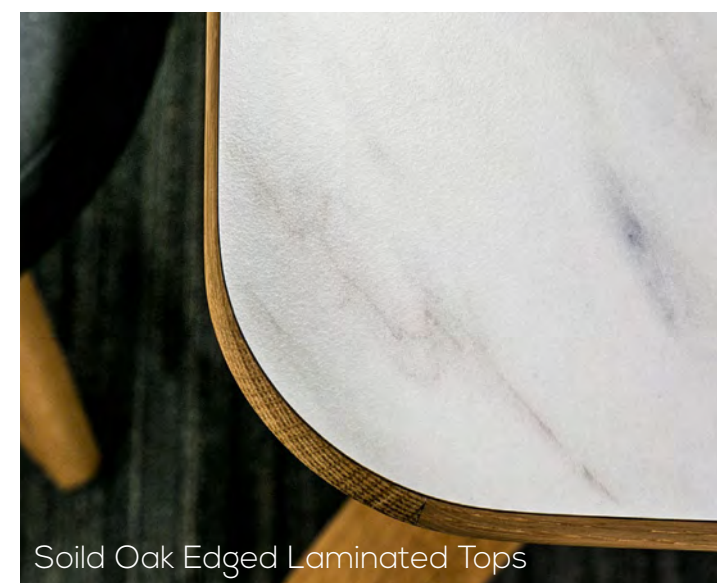
Solid Oak Edged Laminated Tops