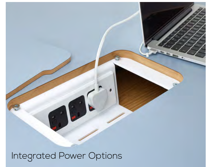
Integrated Power Options