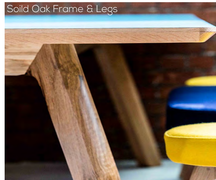
Solid Oak Frame & Legs