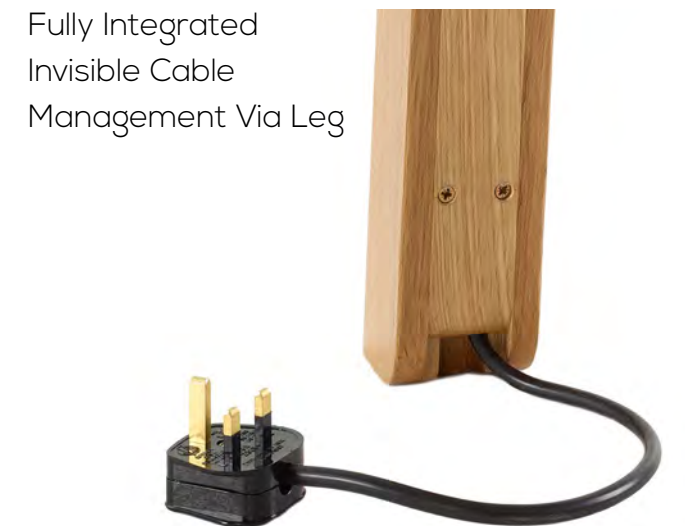
Fully Integrated Invisible Cable Management Via Leg