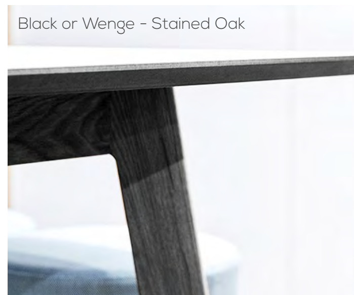
Black or Wenge - Stained Oak