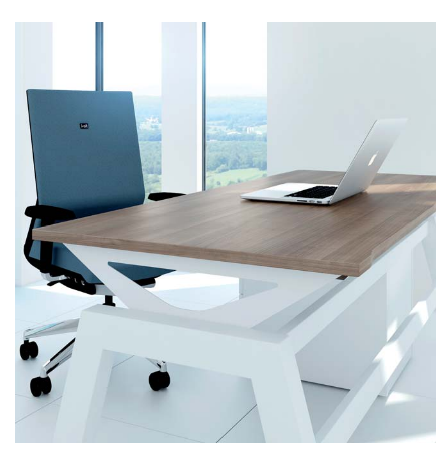
Fixed height workstations can be modified using a conversion kit to transform into a height adjustable desk.