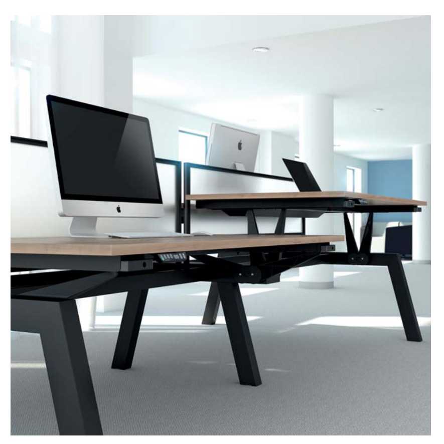
An electric height adjustable option is available. The desk height is adjusted via a keypad allowing the work surface to be raised or lowered.