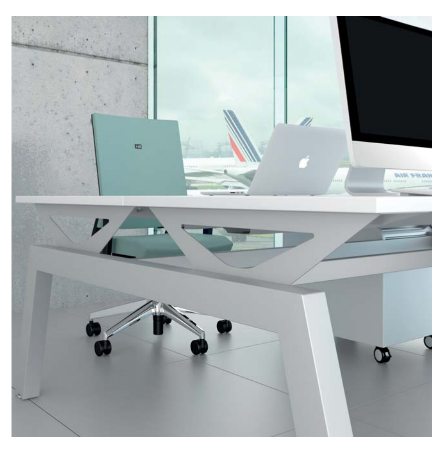
Fixed height options offer a desk height of 725mm. However, an optional retrofit conversion kit is available enabling any fixed height desk top to be converted into a height adjustable option.