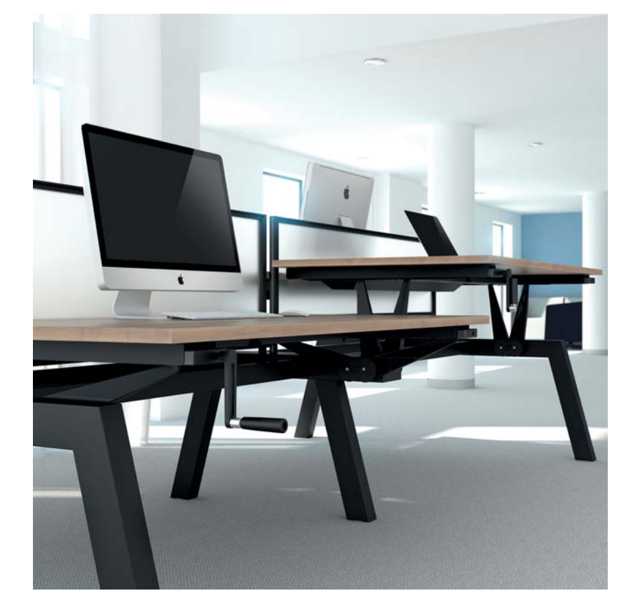
Manual crank height adjustment via a rotating handle.