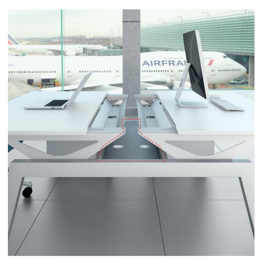
A high capacity horizontal cable tray is an optional extra. The tray fixes to the two internal cross rails and can accommodate large power modules and data blocks. (illustrated in red above)