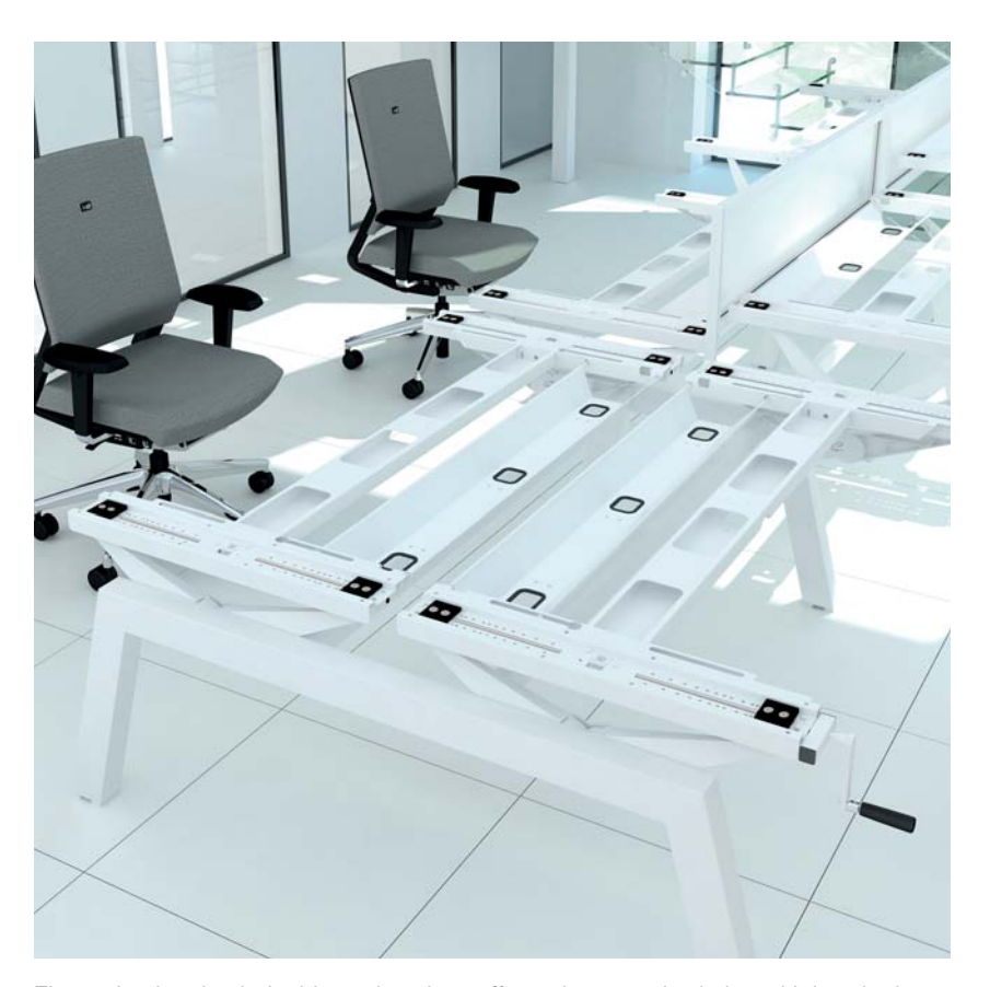
Elevate back to back double workstations offer an integrated solution with leg sharing to maximise underdesk space and legroom for the user.