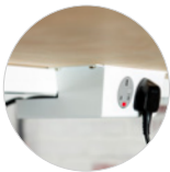
Discreet Power (Please call for more information)