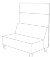
ELE2-SS-SB-W* ELE+ PAN2C** (Double seat with straight back)