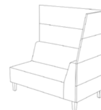
ELE2-SS-CBL-W* ELE+PAN2AC** ELE+PANZFL** (Double seat with corner arm on LEFT whilst seated)