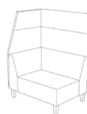
ELE1-SS-CBR-W* ELE-PAN1AC** ELE-PANAZFR** (Single seat with corner arm on RIGHT whilst seated)