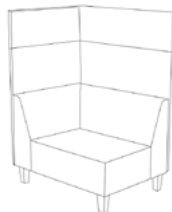
ELE1-SS-CBR-W* ELE+PAN1AC** ELE-PANAC** (Single seat with corner arm on RIGHT whilst seated)

Plus panel, single seater-no arms, can be connected on both sides)