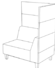
ELE1-SS-CBL-W* ELE-PAN1AC** ELE-PANAC** (Single seat with corner arm on LEFT whilst seated)