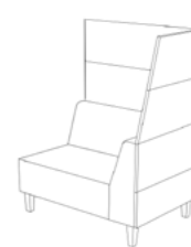
ELE1-SS-CBL-W* ELE-PAN1AC** ELE-PANAZFL** (Single seat with corner arm on LEFT whilst seated)