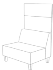
ELE1-SS-SB-W* ELE+PAN1C** (Single seat with straight back)

Plus panel, single seater-no arms, can be connected on both sides)