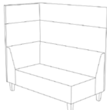
ELE2-SS-CBR-W* ELE+PAN2AC** ELE+PANAC** (Double seat with corner arm on RIGHT whilst seated)