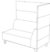
ELE2-SS-CBL-W* ELE+PAN2AC** ELE+PANAC** (Double seat with corner arm on LEFT whilst seated)