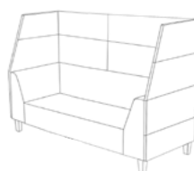
ELE2-SS-ALR-W* ELE+PAN2SC** ELE+PANAZFR** ELE+PANAZFL** (Two seat sofa)

2 Plus finishing arm panels on left and right side)