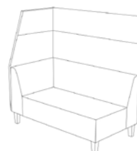
ELE2-SS-CBR-W* ELE+PAN2AC** ELE+PANZFR** (Double seat with corner arm on RIGHT whilst seated)